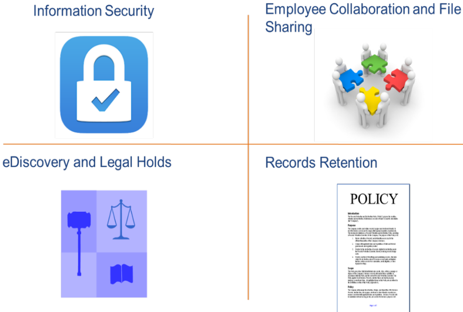
Figure 1 Key Information Governance drivers

Many companies have suddenly been thrust into a position where their employees need to work from home. This raises a number of Information Governance issues: will the information and data that employees access from home be secure? Can they effectively collaborate? Will this come back to haunt companies later during eDiscovery? Can we comply with our records retention requirements? Forced with having to have employees work from home, companies may be tempted to give up trying to maintain good Information Governance strategies in the near term. Today, companies need to go in the other direction, and accelerate Information Governance. Not only for compliance, security and risk reduction, but to ensure their employees can be more productive.